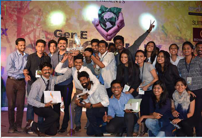
OVERALL CHAMPIONS ARCHISH 2K17 INDUS BUSINESS ACADEMY