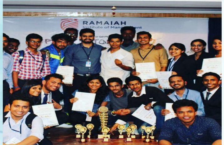
OVERALL CHAMPIONS PERCEPTIONS 2K17 RAMAIAH INSTITUTE OF MANAGEMENT